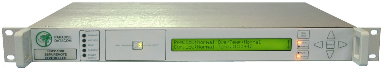
RCP2-1000 Remote Control Panel