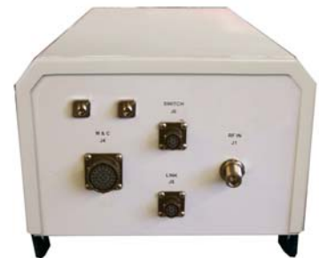
Compact Outdoor SSPA with integrated fiber-optic interface