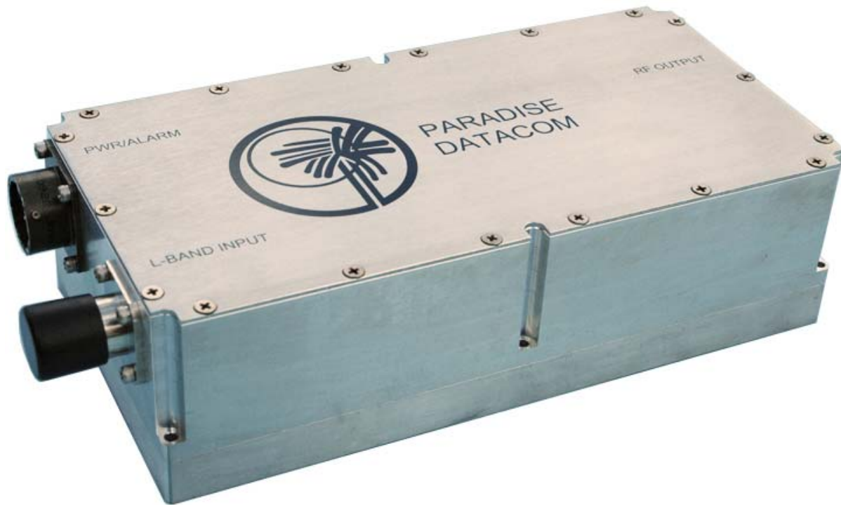
μBUC X-Band or Ku-Band Block Up Converter