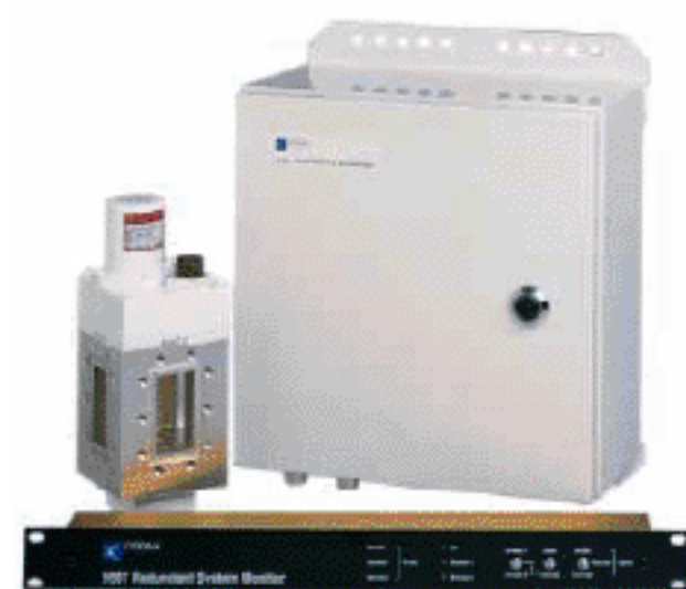
Redundant Switching System: 5586, 5587 and combined WR137/N switch