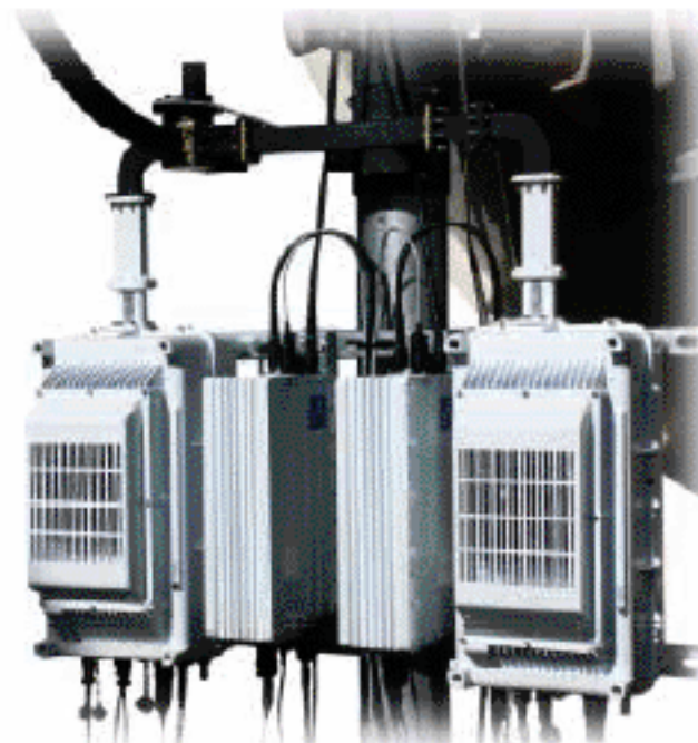
Redundant C-Band 60 W high power transceiver system