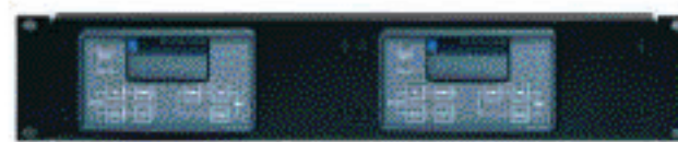
5570D Dual Remote Controller