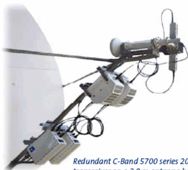
Redundant C-Band 5700 series 20 W transceiver on a 3.8 m antenna boom

The individual transceivers' serial control ports are accessible at the rear of the 5587, enabling connection of ASCII (RS232) or Packet mode (RS485) control systems. Alternatively, a dual Remote Controller 5570D may be connected giving full control of both transceivers from the indoor equipment.