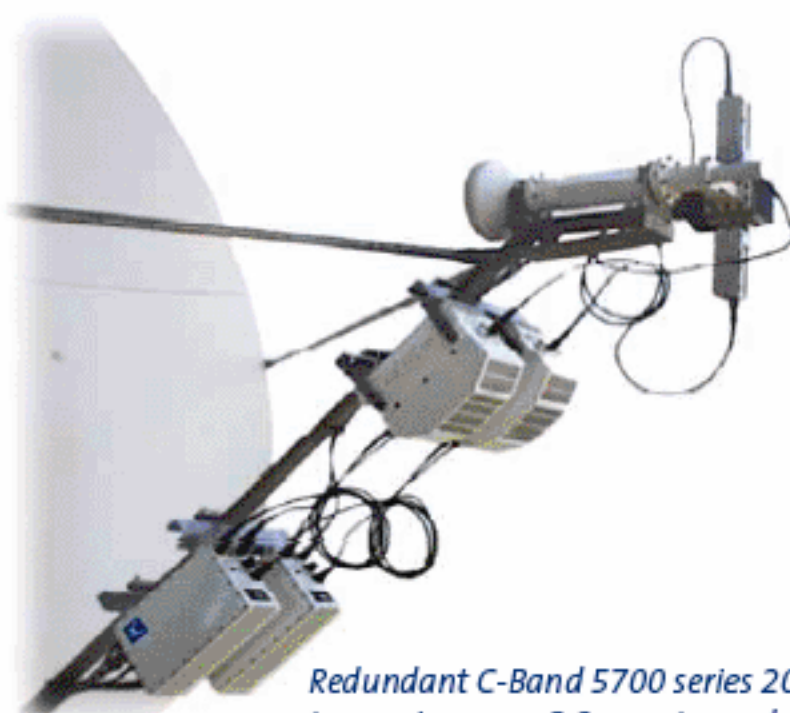
Redundant C-Band 5700 series 20 W transceiver on a 3.8 m antenna boom

The individual transceivers' serial control ports are accessible at the rear of the 5587, enabling connection of ASCII (RS232) or Packet mode (RS485) control systems. Alternatively, a dual Remote Controller 5570D may be connected giving full control of both transceivers from the indoor equipment.